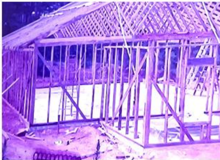
Framework completed with lumber cut from Dave's property

Dave Thorn spent many hours of enjoyment restoring and maintaining his old cars in the garage built with determination, friendship and very little funds.